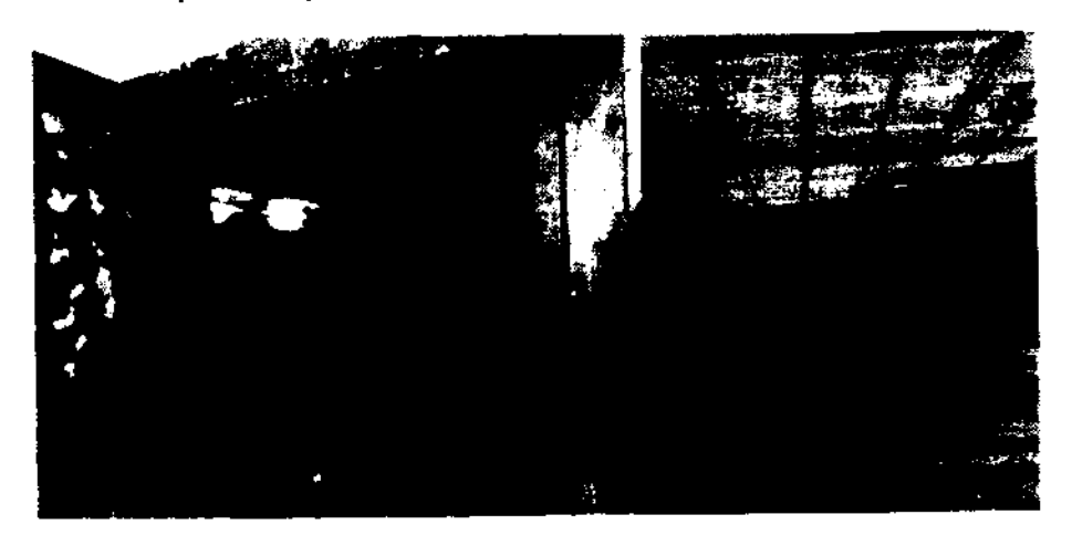
Sound Proofing/Covering at STPs

• <u>Waste Collection</u>: The waste collection is being done in an organized manner and being processed at designated area away from the residential blocks, for pick-up and disposal by the local municipality.